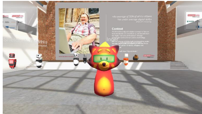
Photo: Group photo from when the attendants at the Connect://able Kick-Off got to test out Mozilla Hubs during lunch hour.